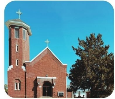
St. Michael 205 Center Street Hume, IL 61932