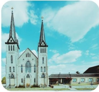
St. Mary 528 N. Main Street Paris, IL 61944