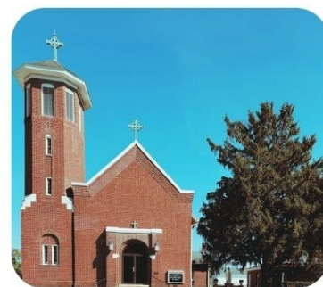
St. Michael 205 Center Street Hume, IL 61932