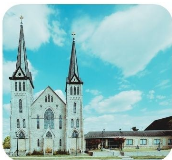
St. Mary 528 N. Main Street Paris, IL 61944