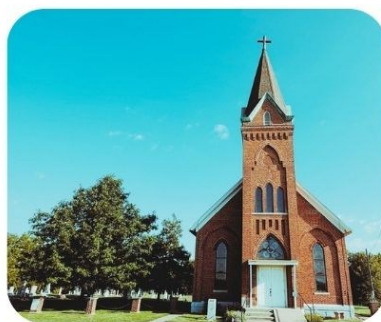
St. Aloysius 18925 E. 1350 Road Paris, IL 61944