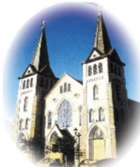
St. Mary 528 N. Main St. • P.O. Box 577 Paris, IL 61944