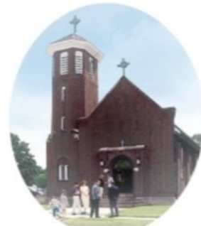
St. Michael 205 Center St. • Hume, IL 61932 P.O. Box 577 • Paris, IL 61944