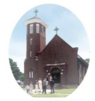
St. Michael 205 Center St. • Hume, IL 61932 P.O. Box 577 • Paris, IL 61944