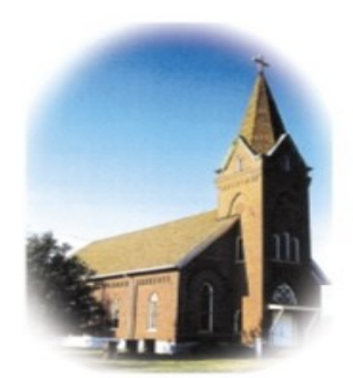
St. Aloysius 18925 E 1350 Rd. • P.O. Box 577 Paris, IL 61944