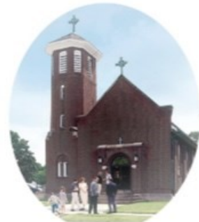
St. Michael 205 Center St. • Hume, IL 61932 P.O. Box 577 • Paris, IL 61944