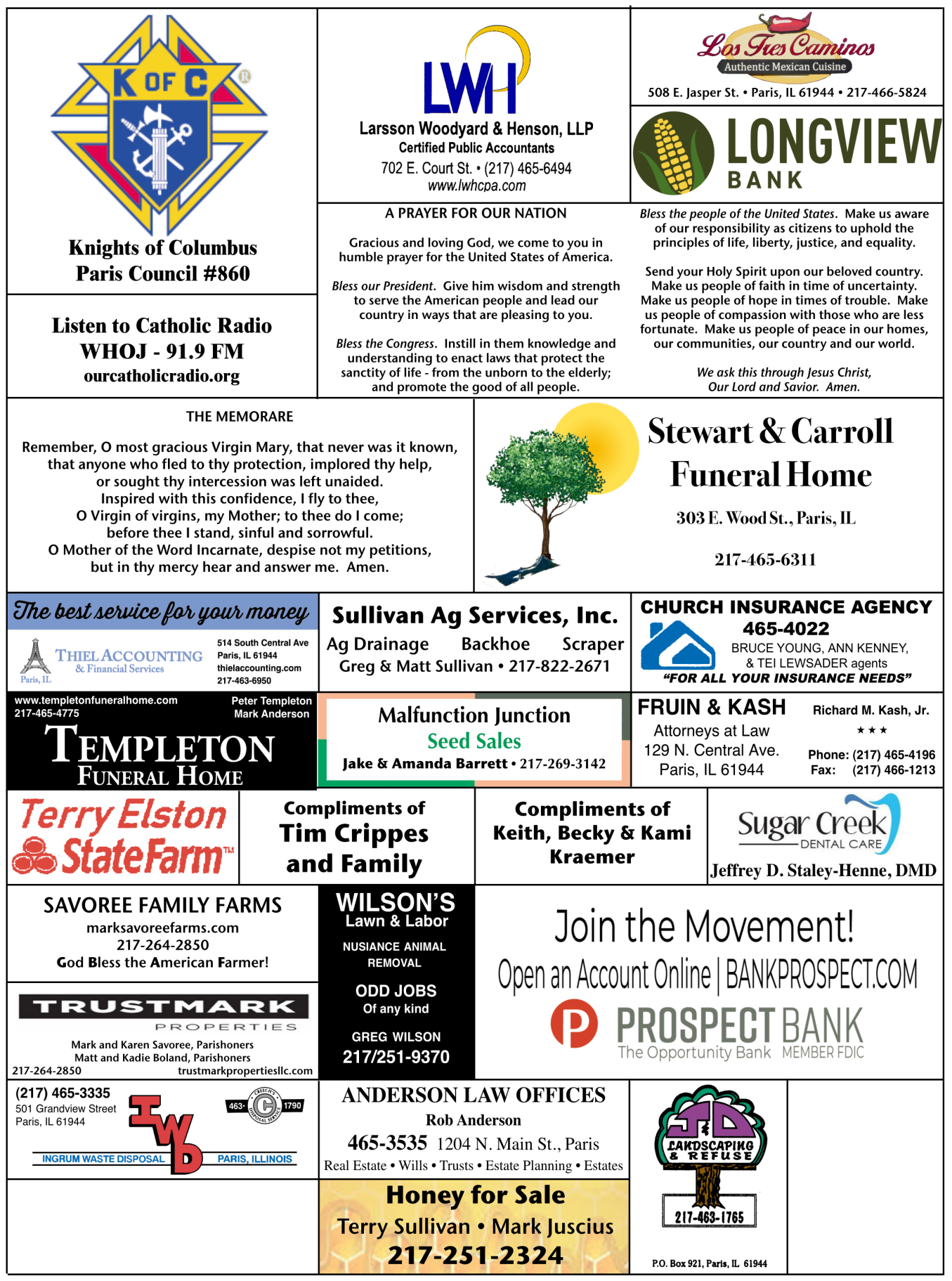
"let them know – you found their ad in the bulletin!"