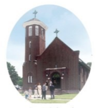
St. Michael 205 Center St. • Hume, IL 61932 P.O. Box 577 • Paris, IL 61944