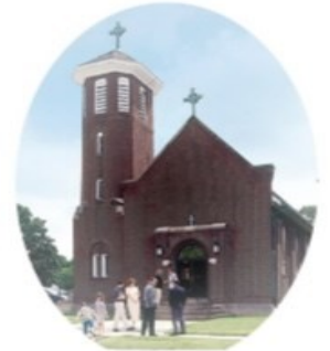
St. Michael 205 Center St. • Hume, IL 61932 P.O. Box 577 • Paris, IL 61944