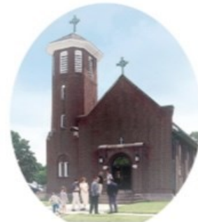
St. Michael 205 Center St. • Hume, IL 61932 P.O. Box 577 • Paris, IL 61944