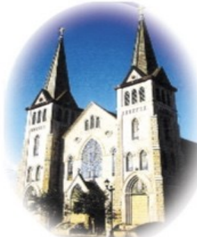
St. Mary 528 N. Main St. • P.O. Box 577 Paris, IL 61944