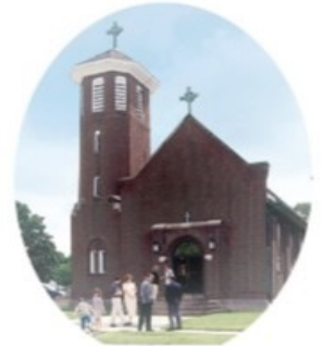
St. Michael 205 Center St. • Hume, IL 61932 P.O. Box 577 • Paris, IL 61944