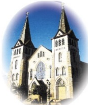
St. Mary 528 N. Main St. • P.O. Box 577 Paris, IL 61944