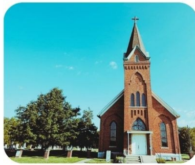
St. Aloysius 18925 E. 1350 Road Paris, IL 61944