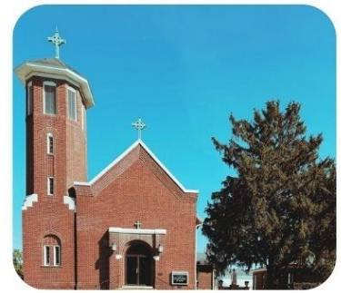
St. Michael 205 Center Street Hume, IL 61932