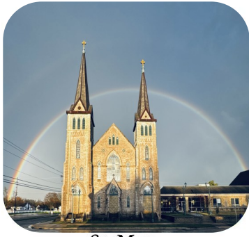
St. Mary 528 N. Main Street Paris, IL 61944