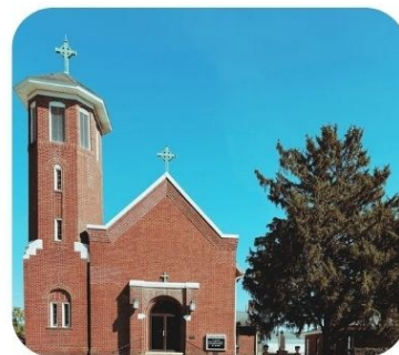
St. Michael 205 Center Street Hume, IL 61932