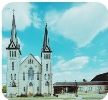
St. Mary 528 N. Main Street Paris, IL 61944