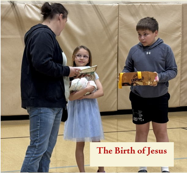
The Birth of Jesus