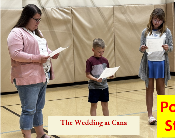
The Wedding at Cana