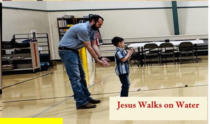
Jesus Walks on Water