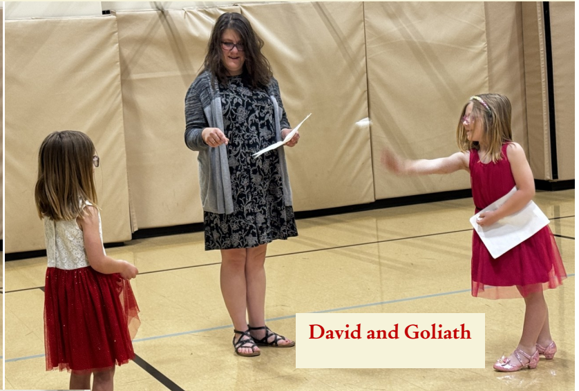
David and Goliath