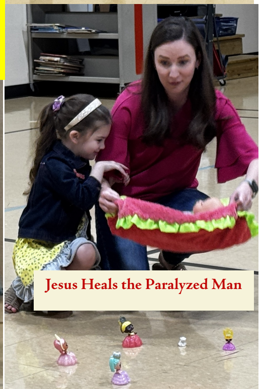
Jesus Heals the Paralyzed Man