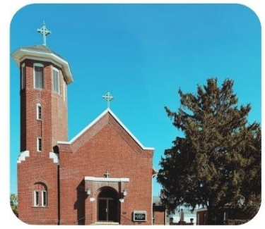
St. Michael 205 Center Street Hume, IL 61932