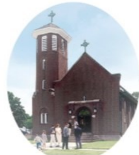
St. Michael 205 Center St. • Hume, IL 61932 P.O. Box 577 • Paris, IL 61944