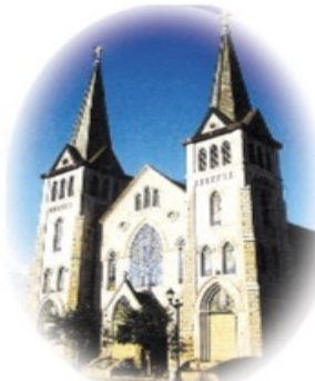
St. Mary 528 N. Main St. • P.O. Box 577 Paris, IL 61944