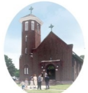
St. Michael 205 Center St. • Hume, IL 61932 P.O. Box 577 • Paris, IL 61944

We are Baptized and Confirmed members called to serve in the Catholic Church, to reach out to our own and to others by prayer, sacrifice and service to all for the praise and Glory of God.