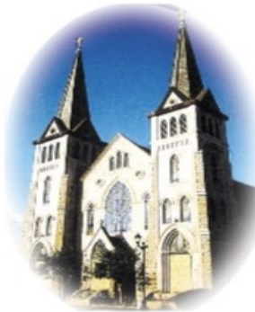
St. Mary 528 N. Main St. • P.O. Box 577 Paris, IL 61944