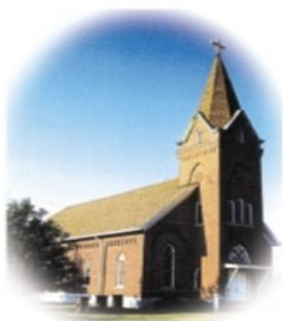
St. Aloysius 18925 E 1350 Rd. • P.O. Box 577 Paris, IL 61944