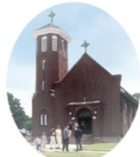
St. Michael 205 Center St. • Hume, IL 61932 P.O. Box 577 • Paris, IL 61944